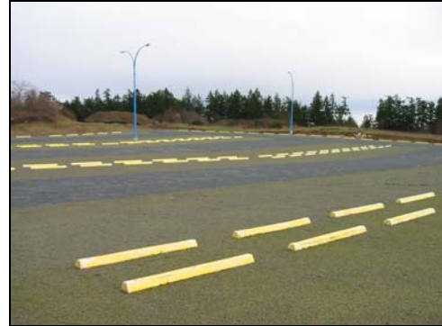
Figure 5: Grasspave parking lot

The advantages of this approach are that it creates the least disturbance to groundwater and rather than creating an excess and localized storm water discharge into nearby creeks and streams, permits a more gradual recharge. It improves plant retention and growth, reduces the amount of landscape watering required from potable water supplies, and thereby improves overall water consumption. It recycles prior materials. A permeable approach of this kind requires ongoing maintenance but avoids stormwater infrastructure maintenance and replacement. It helped gain unanimous community support for the project. Since it reduces heat gain normally associated with asphalt, it has a benefit to adjacent buildings in reduced heat gain and reflection. It also looks better.