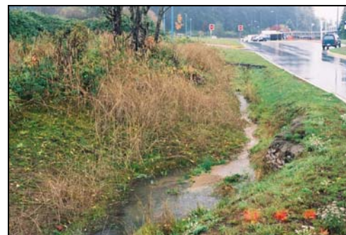
Figure 6: Soft verge drainage

The normal way to construct road edges in this region is to construct concrete curbs with stormwater gutters and drains. This includes oil traps, separators and so on before discharging into creeks or larger storm drains. It was proposed to retrofit existing curbs to some extent, and when new roads and cubs when needed, to use soft verges which would allow rainwater to permeate directly back into the groundwater.