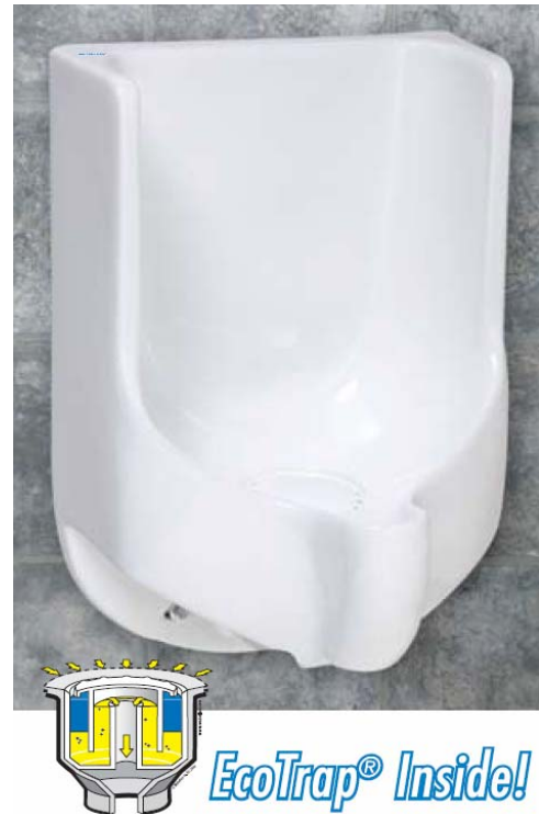
Figure 7: EcoTrap® system

In valuation terms there is a claimed reduction on maintenance and management which would require adjustment of investment pro forma. The main benefit noted by VITP leadership was promotional.