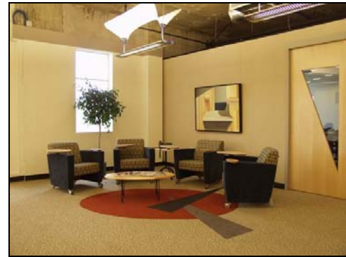
Figure 8: Meeting area with low energy lighting

While this statistic likely includes other factors affecting productivity than solely VITP's sustainable attributes, it suggests the potential for significant occupier benefit. Analysis of data provided by CB Richard Ellis and others undertaken in 2005 shows that staff costs account for approximately 80-85% of company total operating costs, with real estate a relatively small contributor. The 30% productivity improvement thus suggests a value to the business greater than its total expenditures on real estate. The company involved agreed the benefit was and remains substantial.