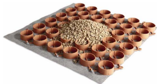
Figure 4: Grasspave