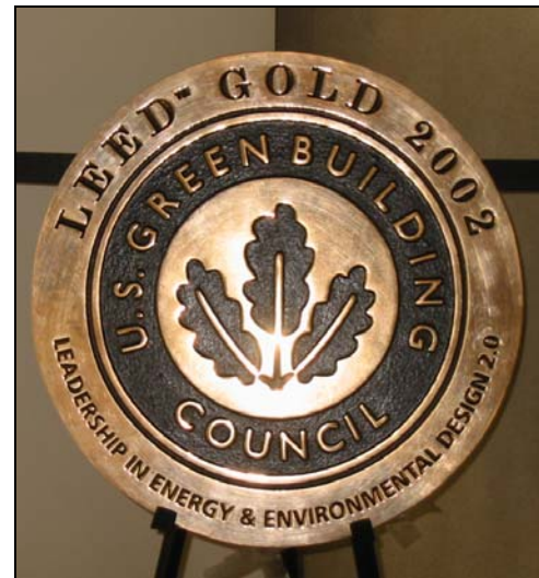
Figure 10: VITP LEED® Gold plaque

The original business case used a hybrid development pro forma with supporting development cost and investment components, which relied on comparables for rental, inducement and other aspects. The analysis did not include debt finance carry for the land, i.e. it used an assumption of land carry whereas most development pro forma software makes an assumption of land carry from point of sale where there is a land valuation. The VITP business case was focused on the exit strategy and project viability, not land value. This was noted on corporate account at depreciated historic cost, which was mostly depreciated. In