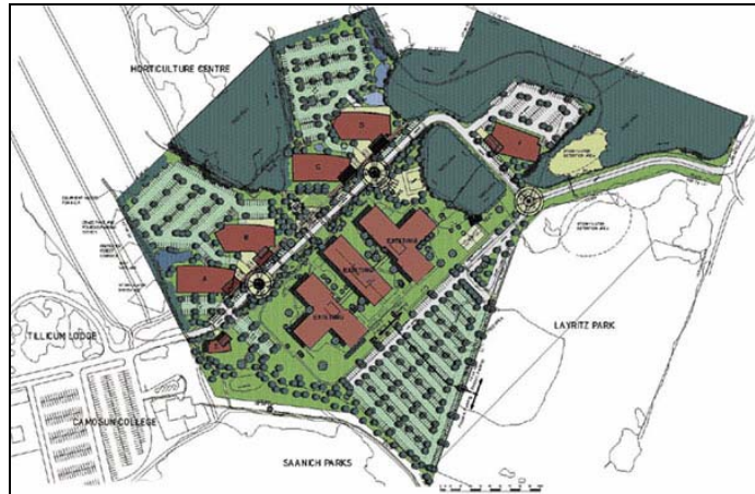
Figure 2: Site plan 2

During the pre-development stages – but after government approvals – the technology sector collapsed and construction prices were rising. Pressured by increased need to distinguish the project and the need to save money, it was proposed to renovate using sustainable principles, which initially met some internal resistance due to perceived risk. The project was however revised to meet green principles with no proposed change in budget or timescale.