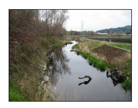
Figure 5: Completed creek late 2002

A standard highest and best use valuation of market value to the land would have been inadequate, but is standard practice and meets the Canadian Uniform Standards of Professional Appraisal Practice, the typical standard for this jurisdiction<sup>3</sup>. Most local appraisals are solely focused on land value and do not adjust for other accounts than the market highest and best use and value. None habitually include analysis of the entire range of wider public or business benefit seen in this example, or consider impact to the environment except where the asset is contaminated (usually termed "impaired").