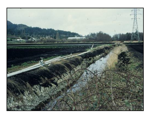
Figure 1: Ditch prior to restoration, early 2000