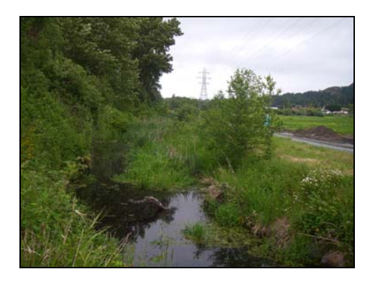
Figure 6: Same view, mid-2006

A normal valuation/appraisal approach does not often address underlying project risk and include it in the evaluation, nor did the project team in this instance. Lending institutions do not typically require a risk assessment as part of the normal appraisal, which usually addresses variations on market asset security