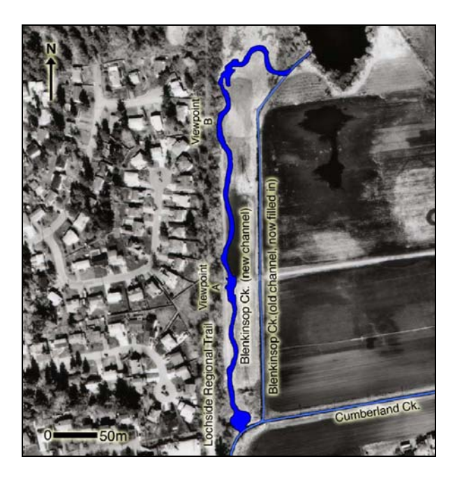
Figure 3: Project Plan

In financial terms, undiscounted, the project yielded an approximate 28% cash-on-cash return on investment. Figures were not available to calculate with certainty an accurate Return on Investment (ROI) or Internal Rate of Return (IRR). By estimation it appears to be achieving approximately a ten year payback. By normal standards this may be deemed a protracted return however (a) the benefit is reasonably certain to continue; and, (b) other benefits would improve this return.