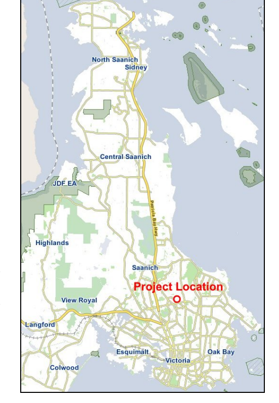
Figure 2: Location Saanich, BC, Canada

The project has been extensively written about in a variety of areas across Canada and the United States. However no financial benefits were originally claimed or analysed and the beneficiaries were the farm, the public and nature. A review showed that financial benefits existed, however historic data was not segregated to permit analysis, but agglomerated in general accounts. Two main financial aspects could however be identified: